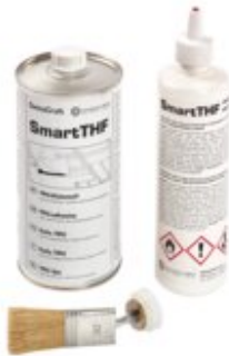
WELD, Flasche + Pinsel